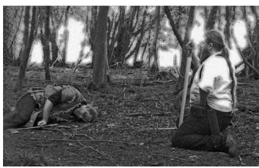
Redhawk lies dead at the hands of General Pepper

All correspondence to be directed to the editor at 3 South Main Street. Subscription information to the same